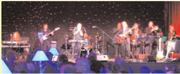
CHICAGO BLUES FESTIVAL!