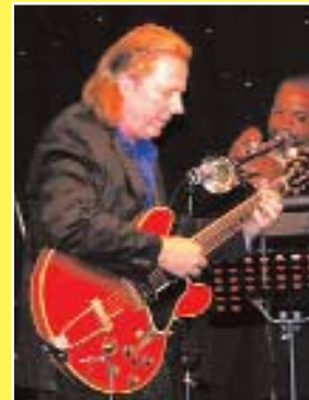
Harry Reinhart Guitars